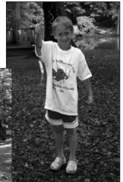
A Proud Fisherman